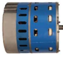
A Great Truck Stock Item

Zack Bray, Western Component Sales will present on the Azure™ Digi-Motor® from MARS. This is a perfect motor for truck stock. It is a high efficiency variable speed direct drive