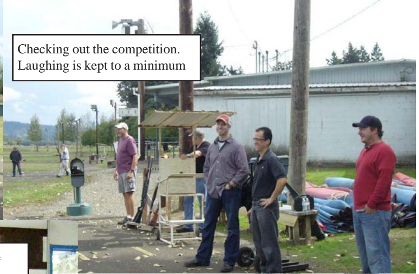
Checking out the competition. Laughing is kept to a minimum