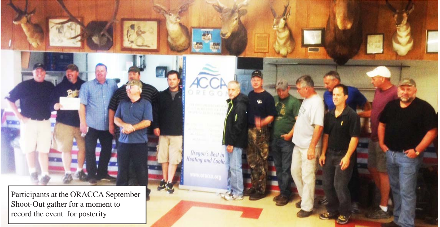
Participants at the ORACCA September Shoot-Out gather for a moment to record the event for posterity