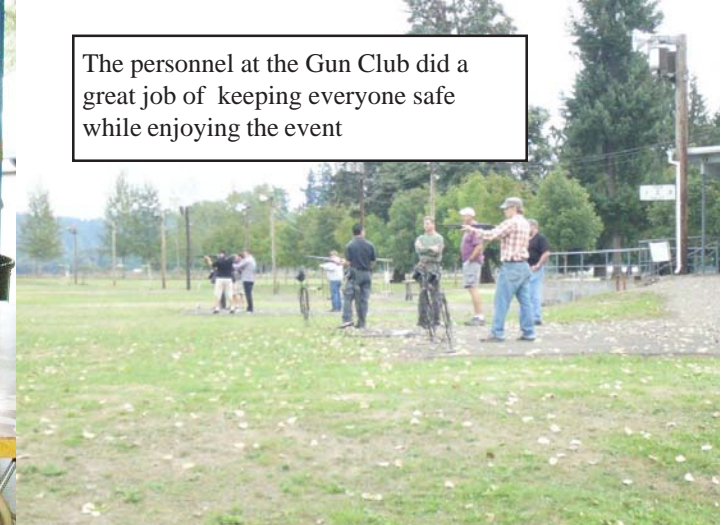
The personnel at the Gun Club did a great job of keeping everyone safe while enjoying the event